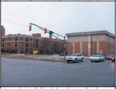
The illustration above shows new infill development across from The Children's Museum at 30th Street and Meridian Street. Exciting architecture contributes to the museum, but traditional patterns and materials also help it contribute to its historic surroundings. The building is mixed-use, with retail shops on the ground floor and offices or apartments above.