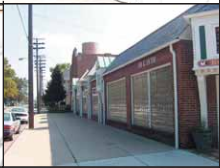
The illustration below shows new infill development at 30th Street and Central Avenue.