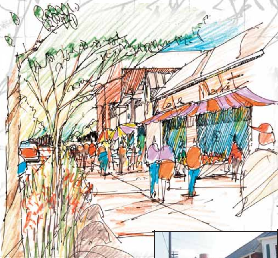
The illustration above shows how the existing commercial building at 34th Street and Pennsylvania Street can be rehabilitated into a neighborhood-oriented retail node, where neighbors could pick up a bite to eat or talk over coffee.